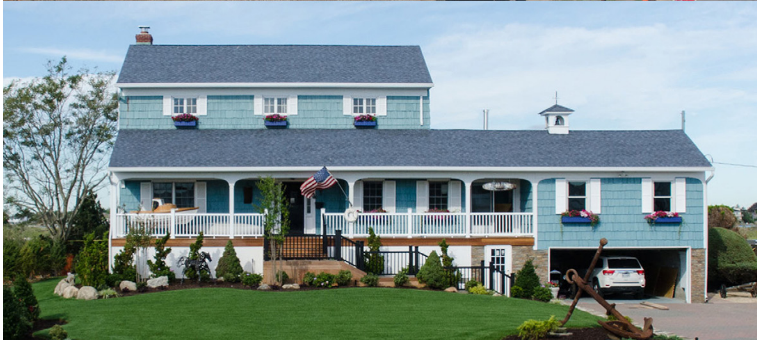
Project example: House Elevation – Freeport, New York