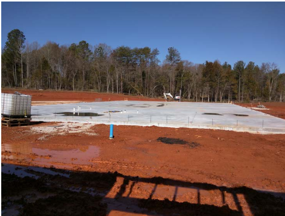
Shop Building Slab