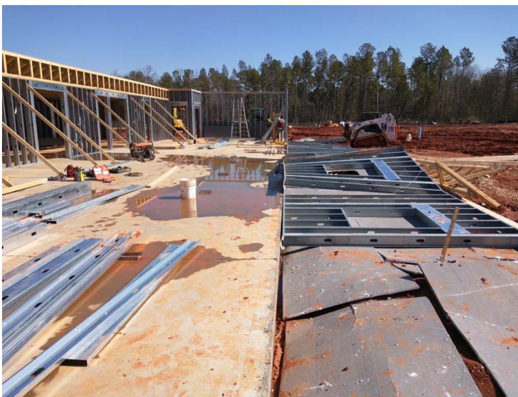
Metal Stud Wall After The Storm