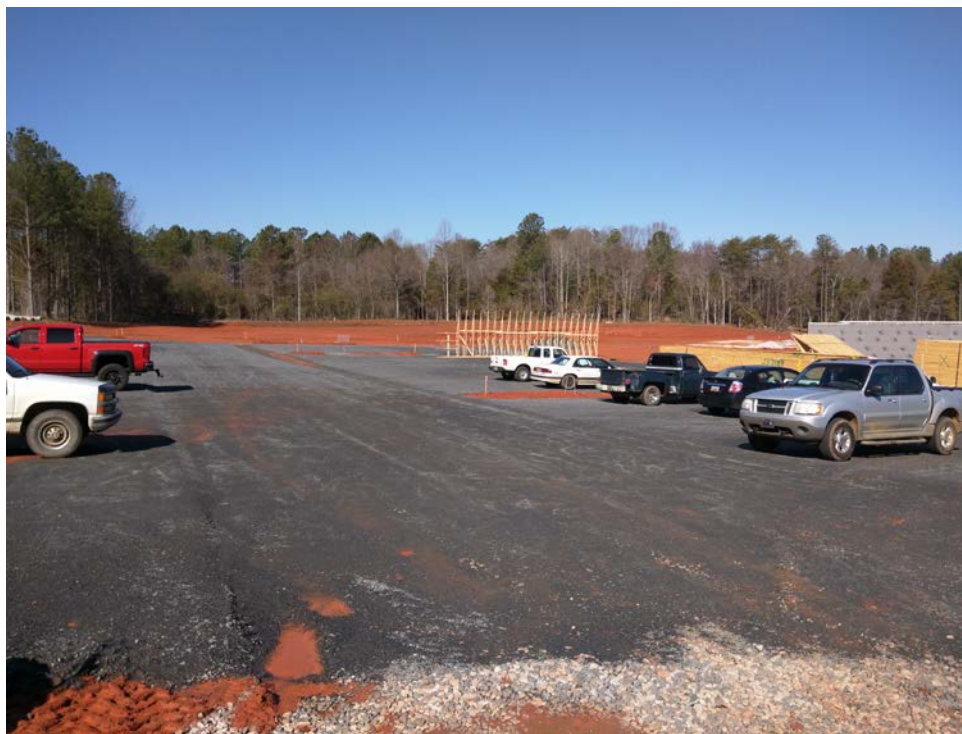
Front Parking Lot