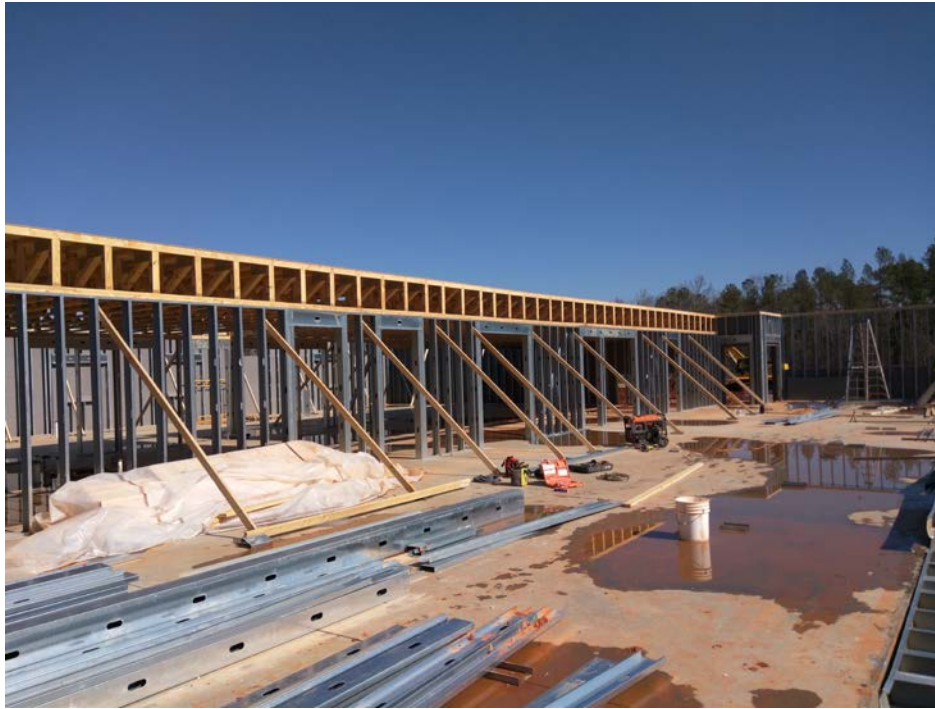
Floor Trusses at Administration Building