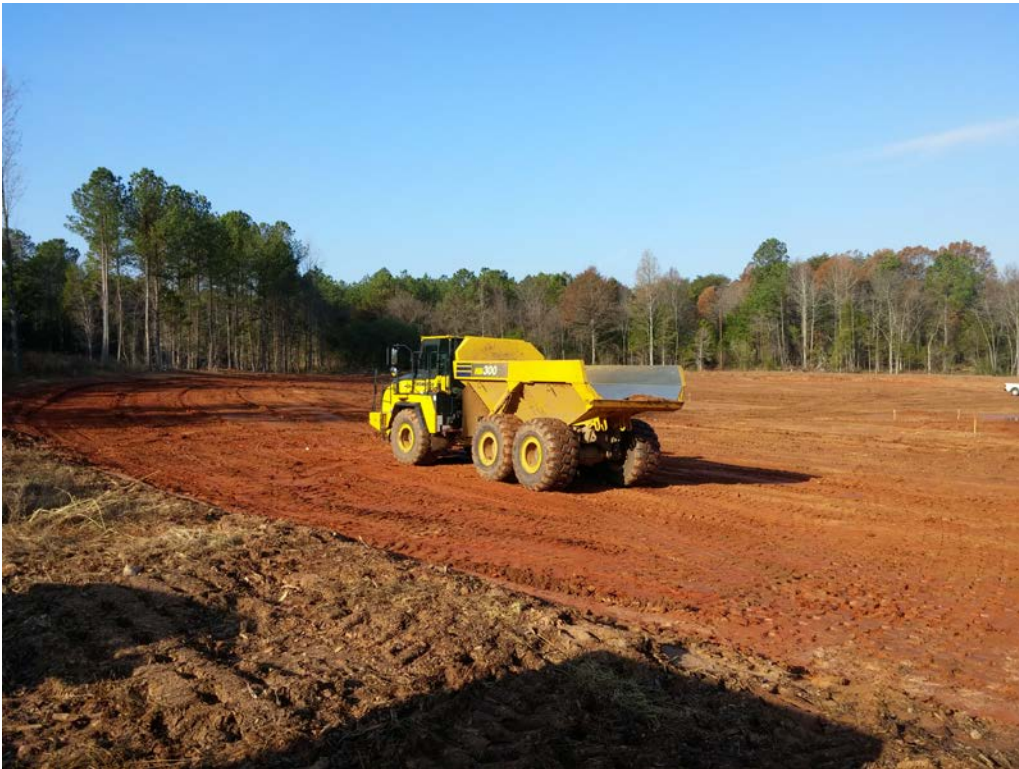
Main Parking Area