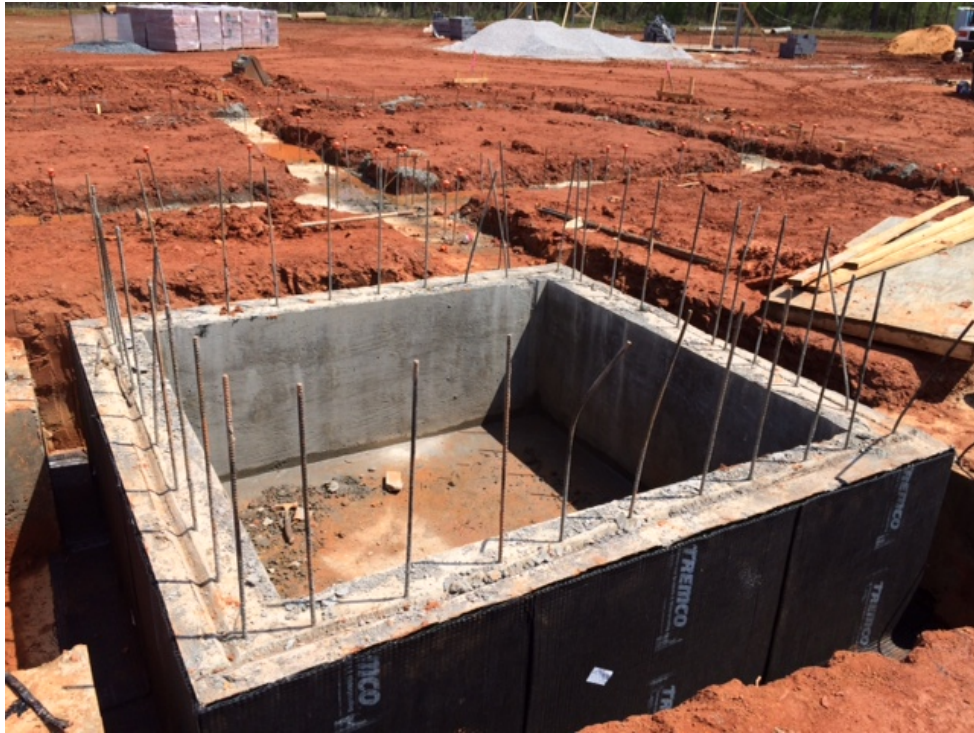
Elevator Pit at Training Tower