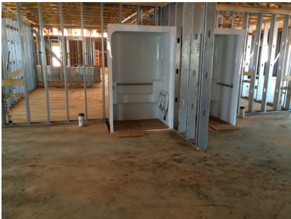
Administration Building Interior Framing & Rough-in