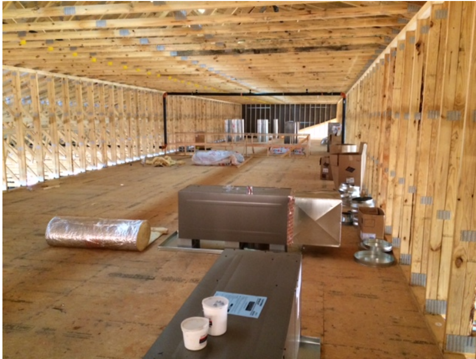
Mezzanine at Administration Building